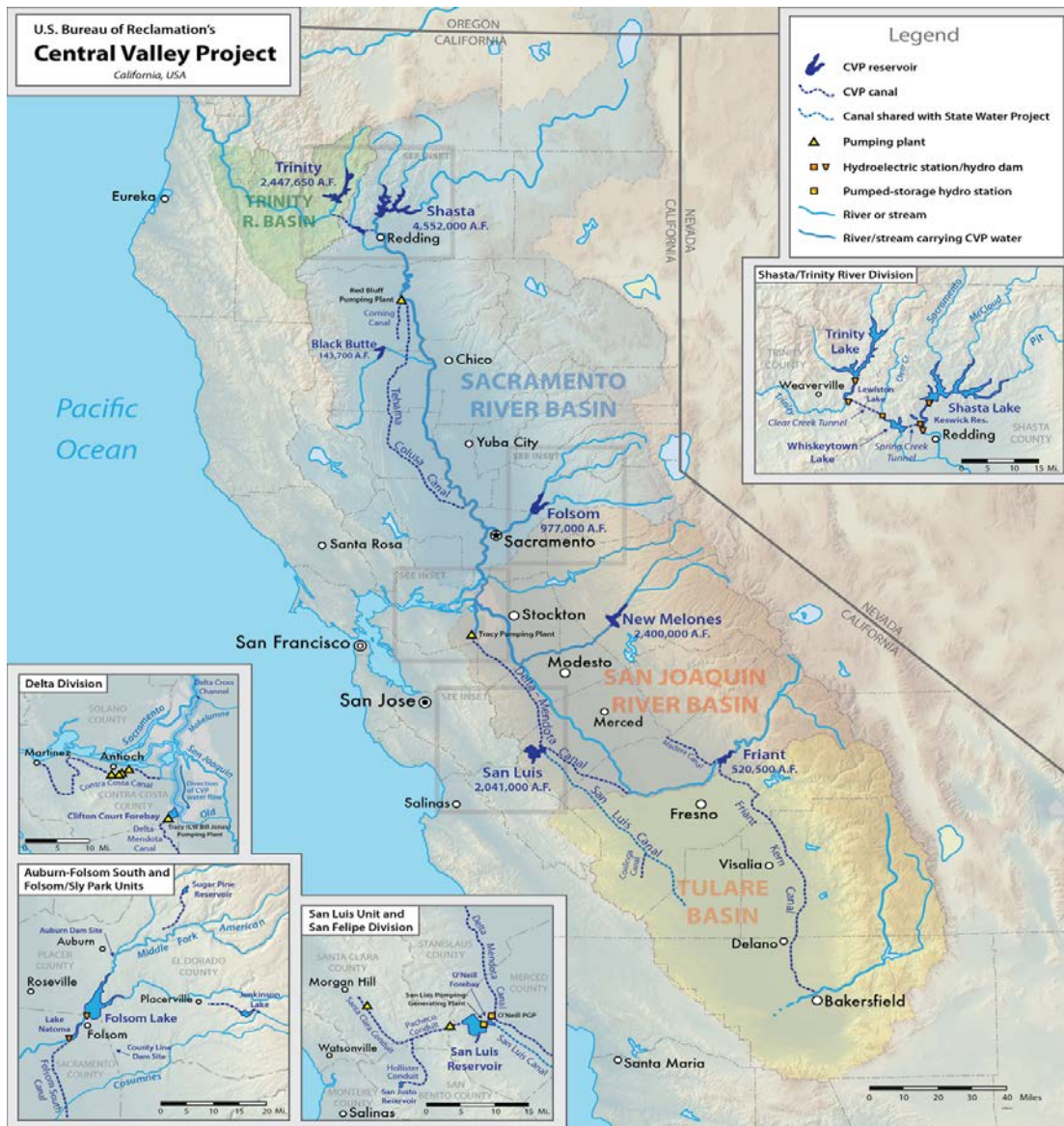
Figure 2-1. CVP Project Area